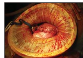
Reduces need to exteriorize uterus for suturing ... less post-operative pain.