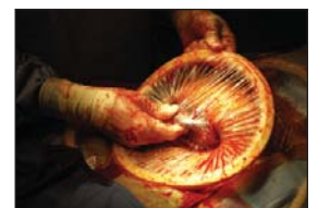
Device is removed in seconds, simplifies clean up.