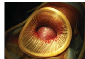
Maximum exposure of the uterus. No obstructions in the surgical field.