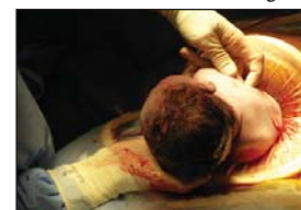
Soft, compliant material helps reduce chance of complications. Incision is completely lined to reduce risk of wound infection.